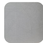
SLATE (fused seams)