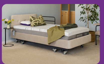
CurveX® independent Bed Corner Code: ICCX

To order your upgraded bed to CurveX® Bed Corners, this will need to be specified at time of order placement.