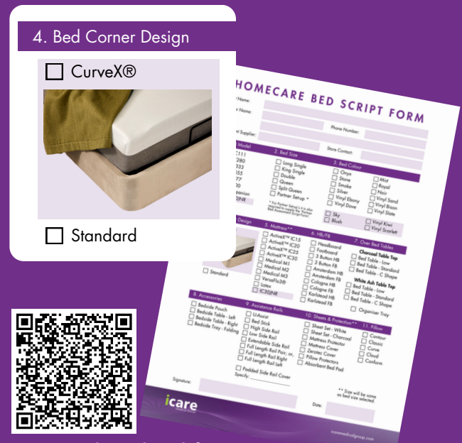
Scan to download form.

Add Code: ICCX as line item for independent beds (LS, KS, D, Q, SQ) Add Code: PSCX as line item for Partner Setups (i.e. IC100LS + IC333LS)